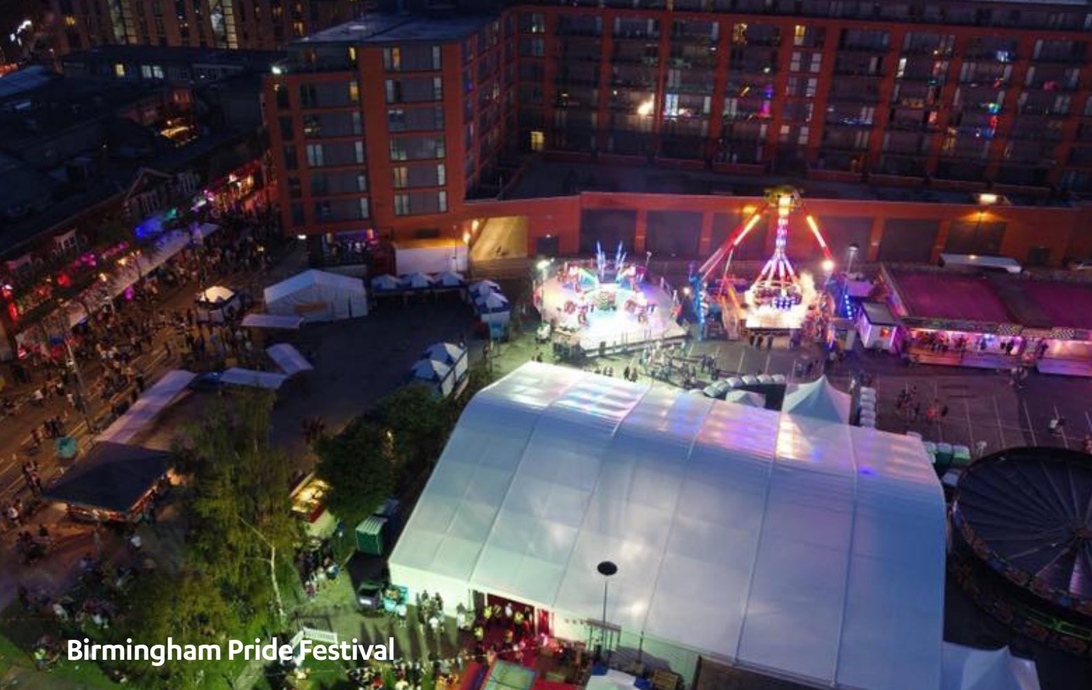
Birmingham Pride Festival