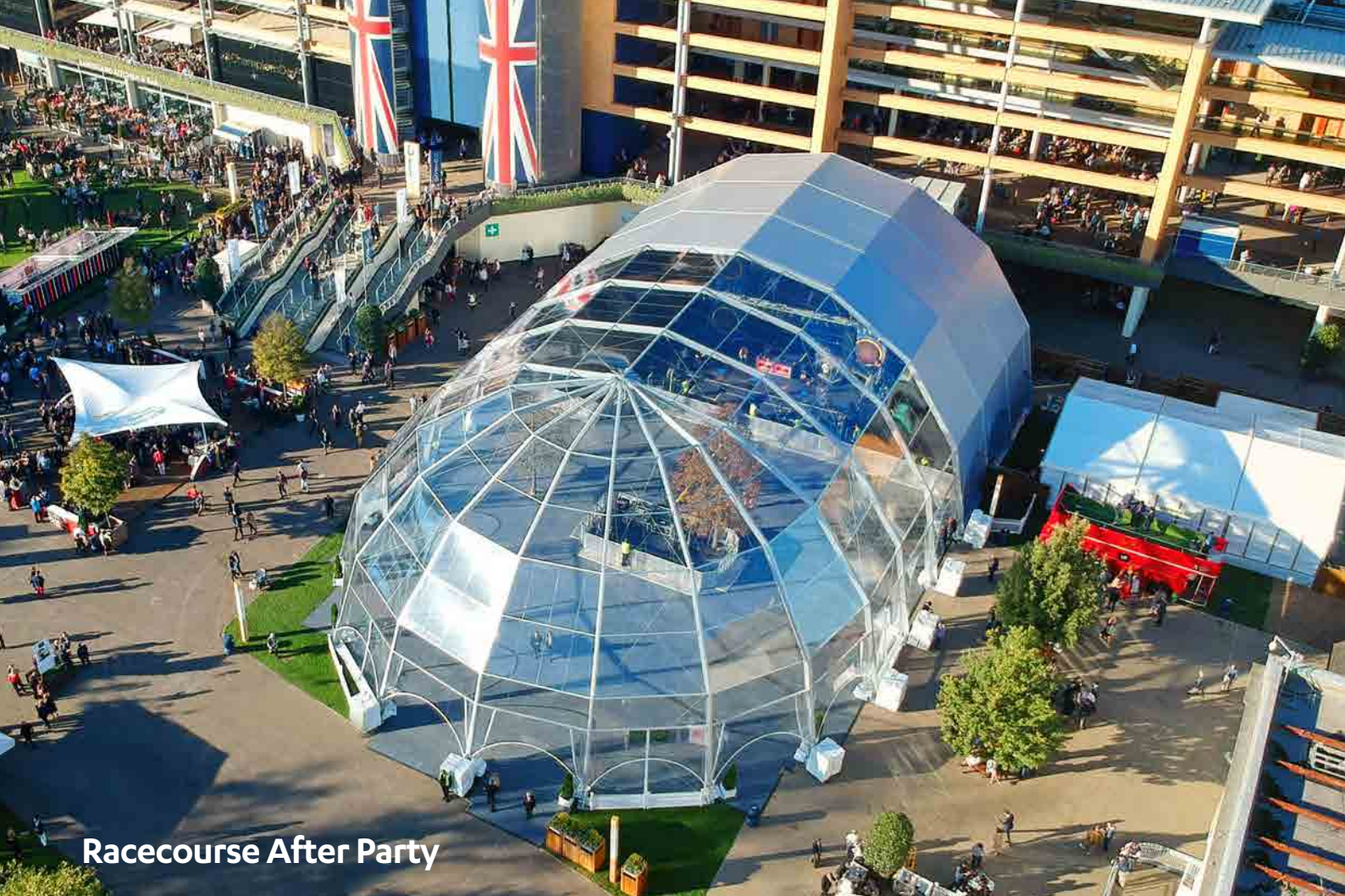
Racecourse After Party