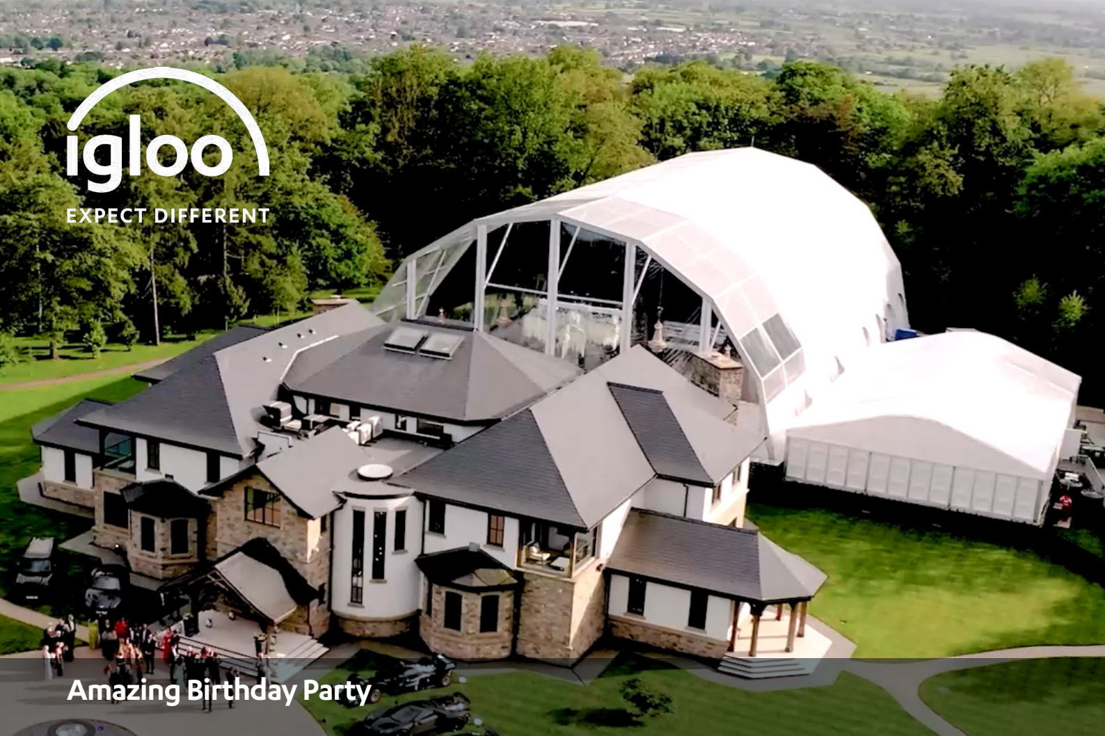
Amazing Birthday Party