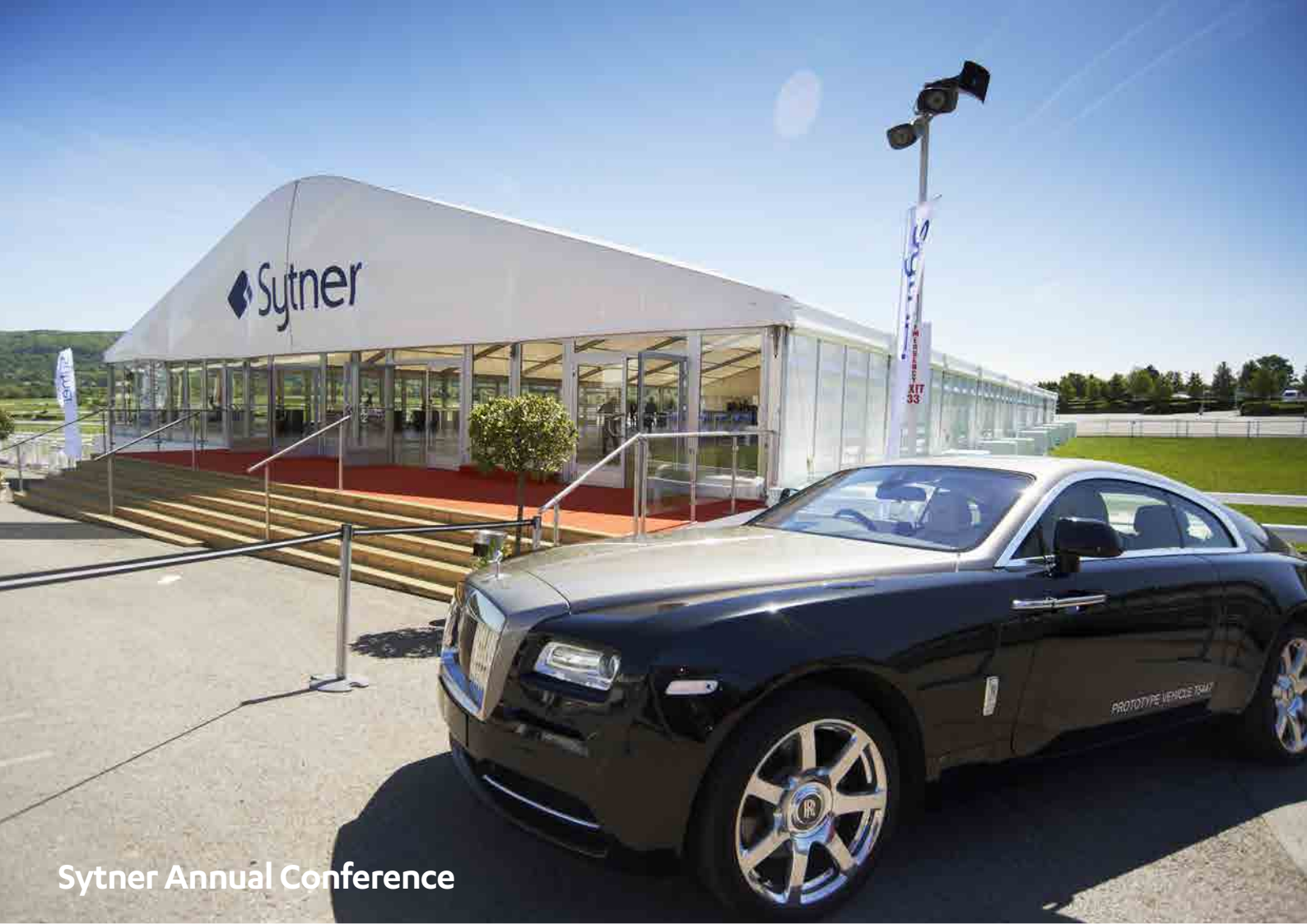
Sytner Annual Conference