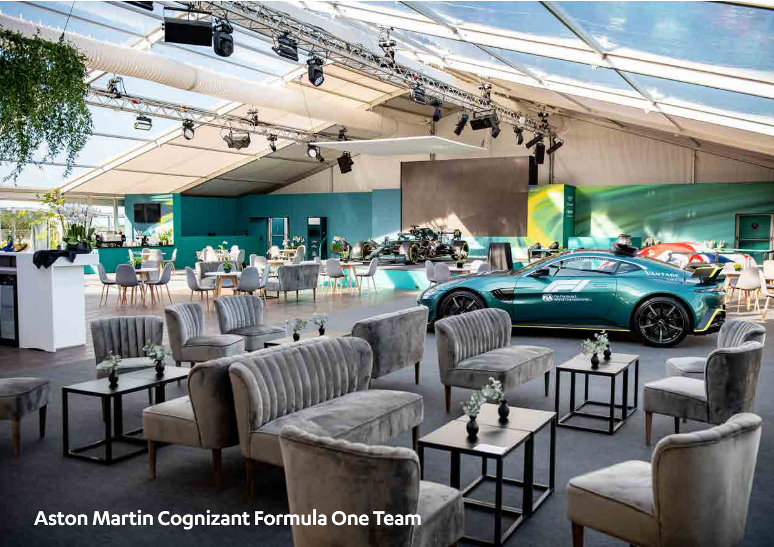
Aston Martin Cognizant Formula One Team