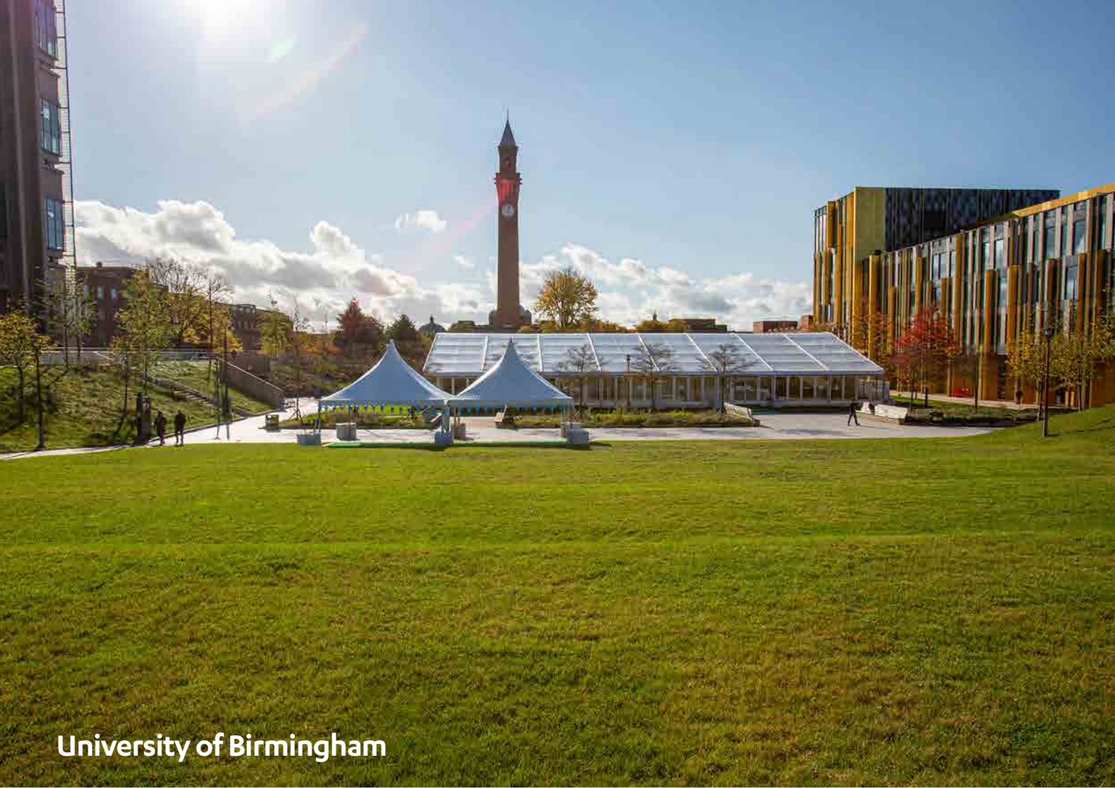
University of Birmingham