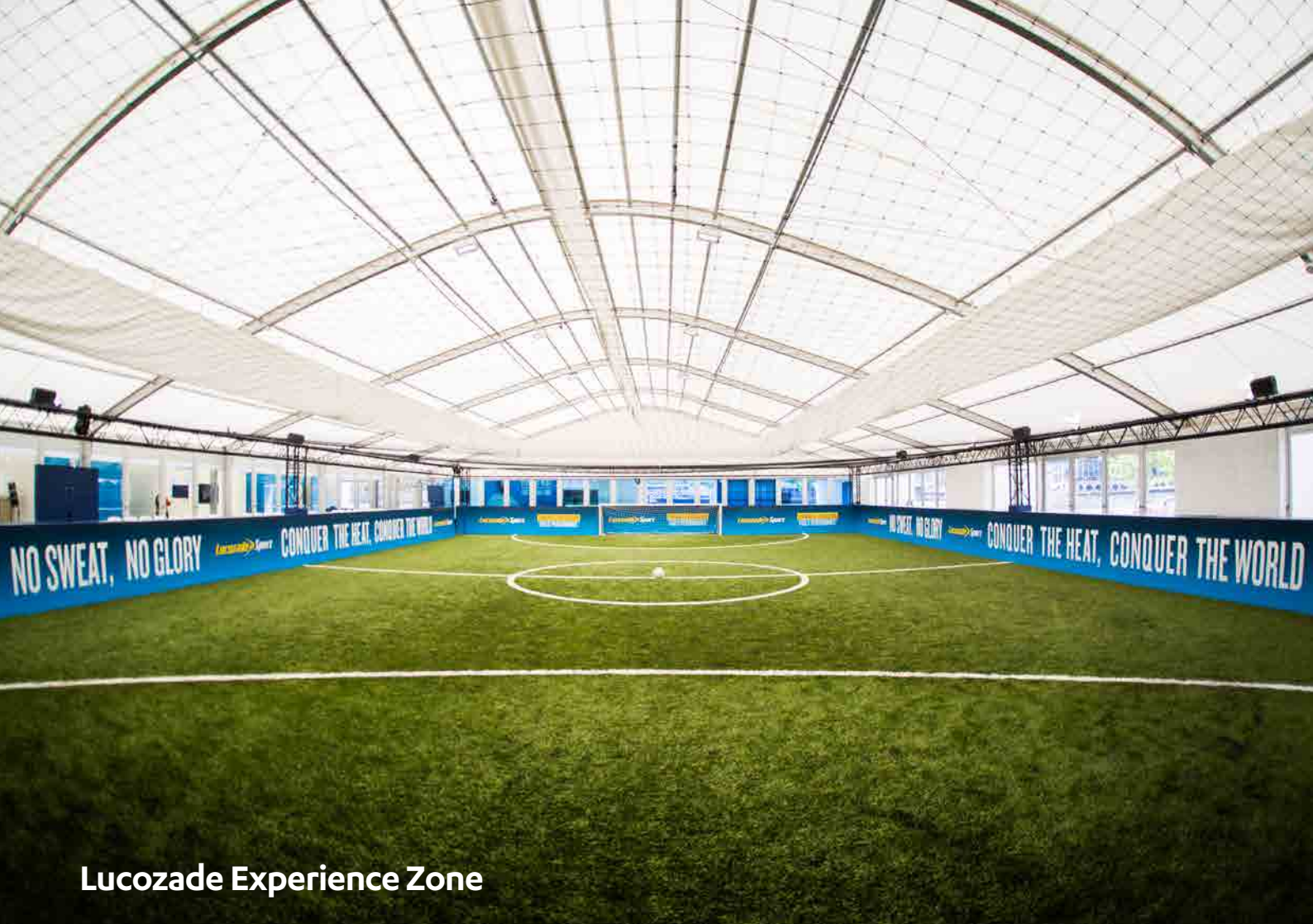
Lucozade Experience Zone