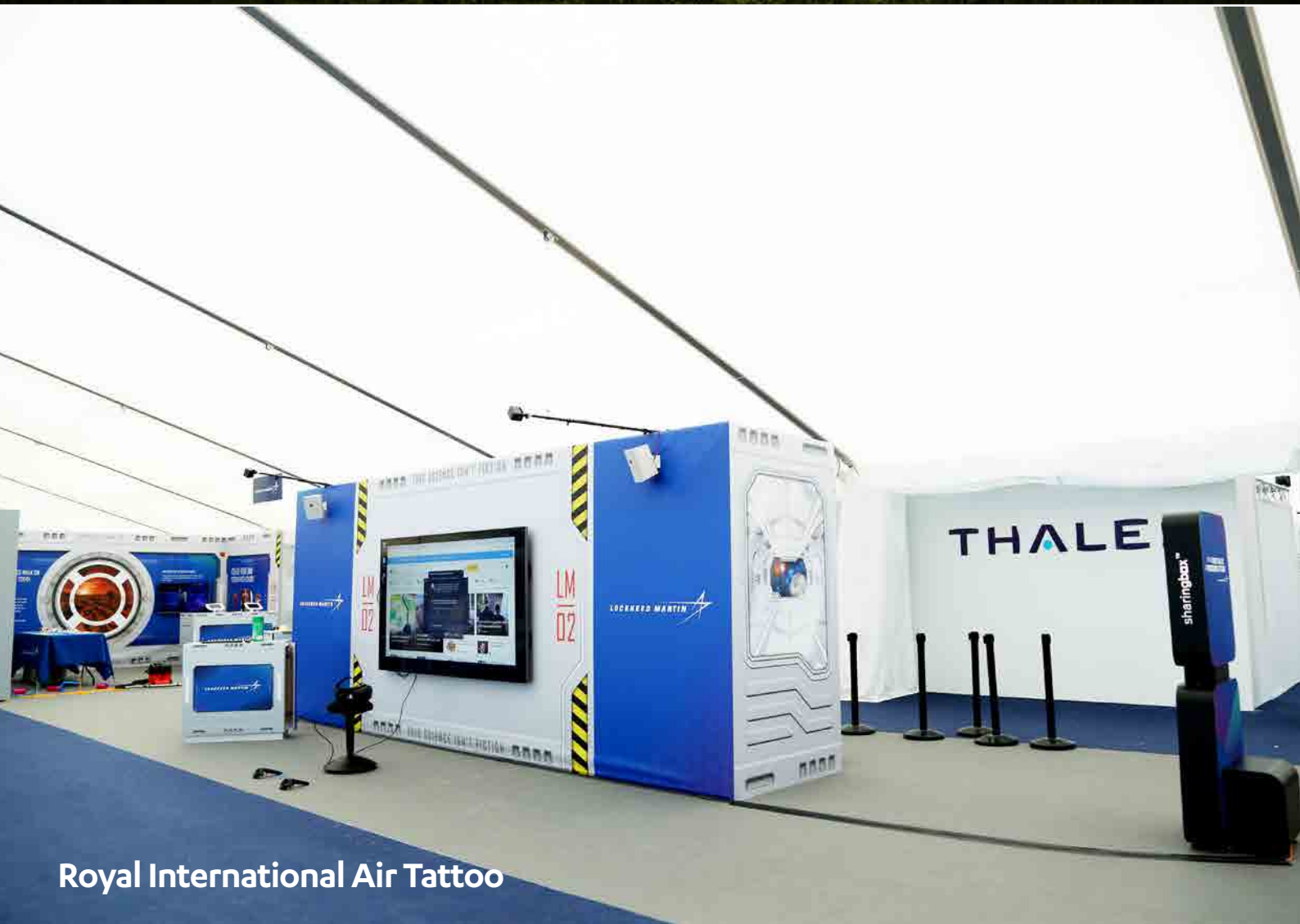
Royal International Air Tattoo